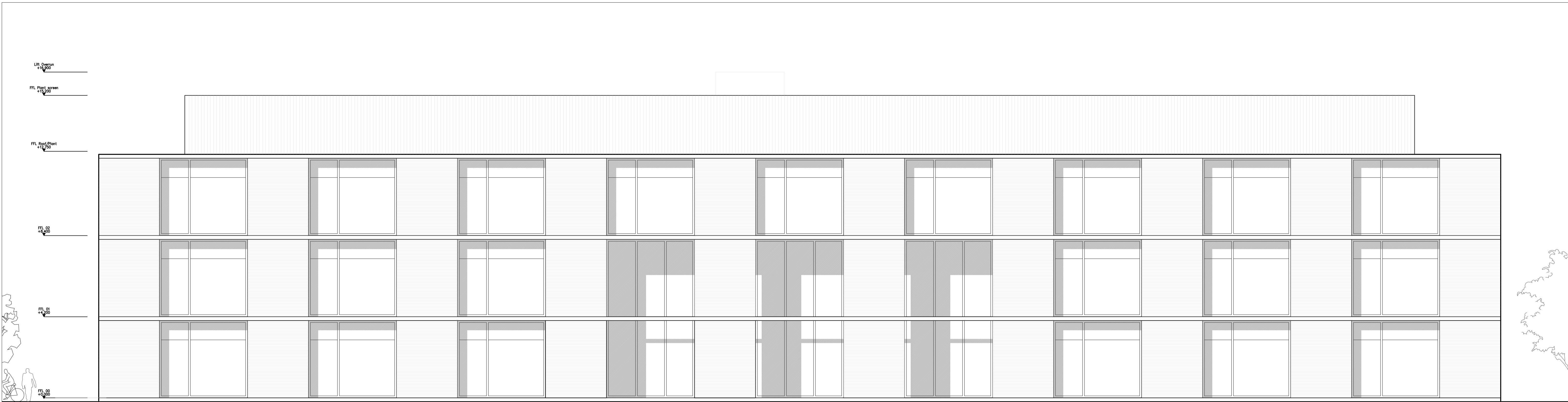
01 | South Elevation 1:100