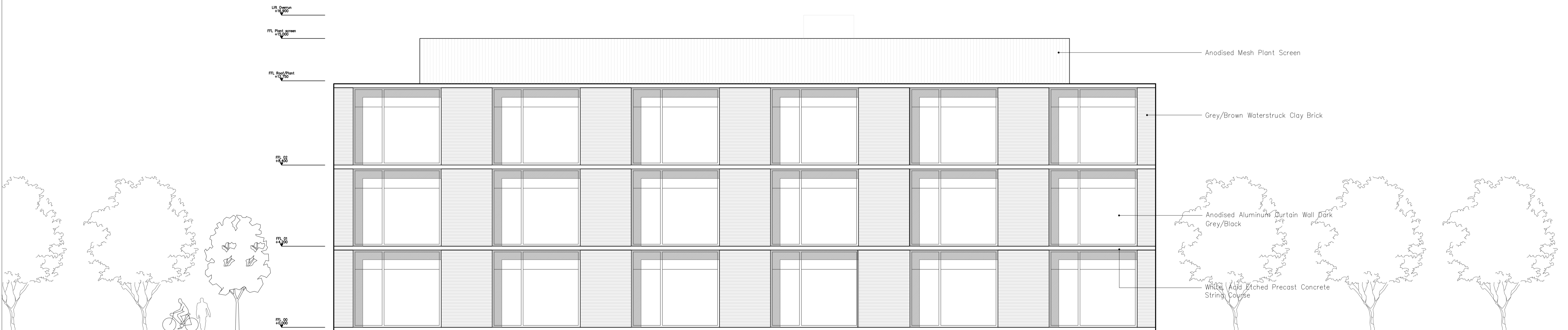
02 | East Elevation 1:100

DO NOT SCALE FROM THIS DRAWING. THIS DRAWING IS BASED ON DIMENSIONAL SURVEY INFORMATION PROVIDED BY OTHERS. THE ARCHITECT CANNOT ACCEPT RESPONSIBILITY FOR THE ACCURACY OF THIS SURVEY INFORMATION. ALL DIMENSIONS ARE SHOWN IN METRIC. THIS DRAWING REMAINS THE COPYRIGHT OF STALLAN-BRAND ARCHITECTURE • DESIGN LTD