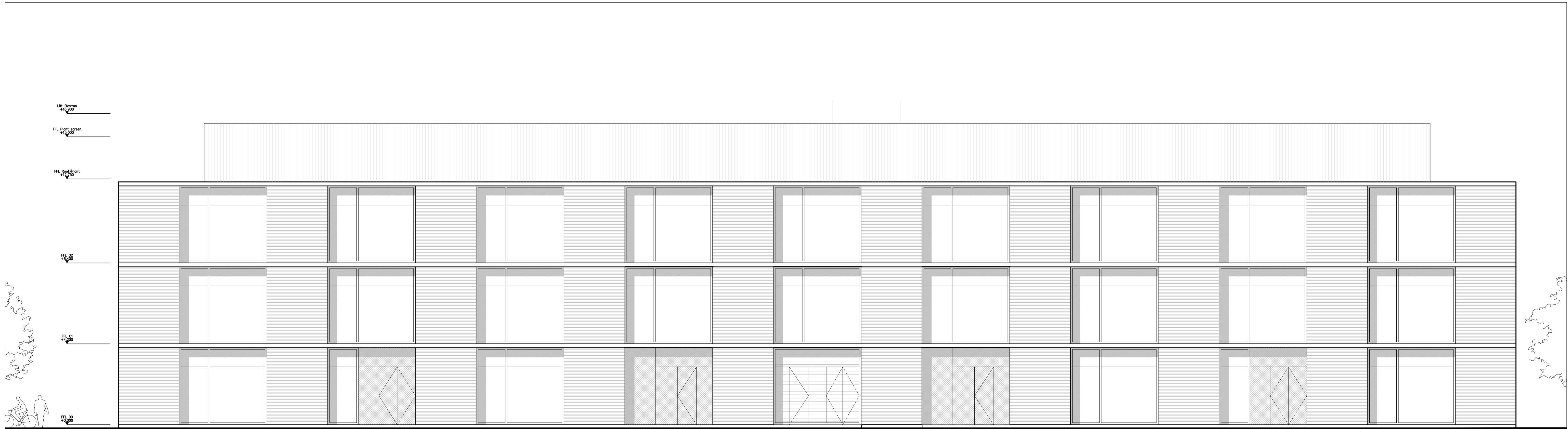
01 | North Elevation T1000