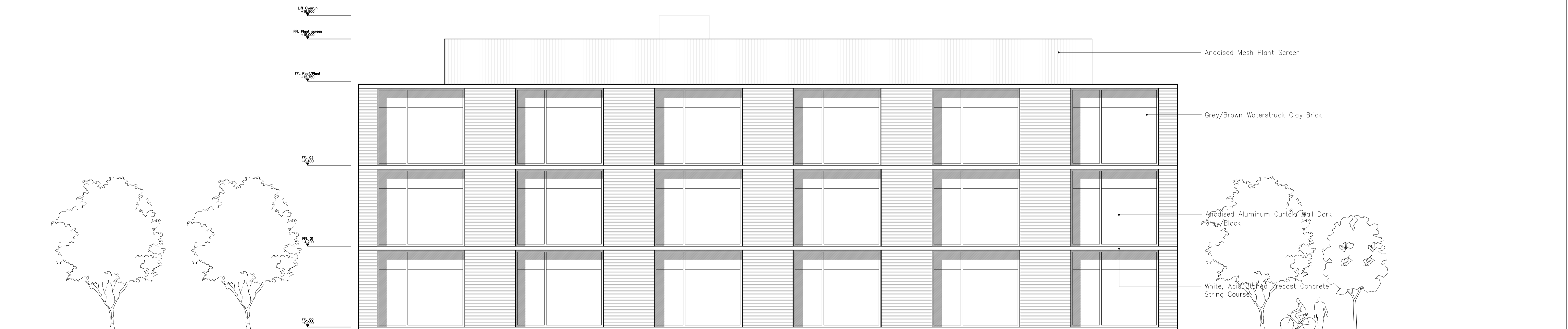
02 | West Elevation T1000

DO NOT SCALE FROM THIS DRAWING. THIS DRAWING IS BASED ON DIMENSIONAL SURVEY INFORMATION PROVIDED BY OTHERS. THE ARCHITECT CANNOT ACCEPT RESPONSIBILITY FOR THE ACCURACY OF THIS SURVEY INFORMATION. ALL DIMENSIONS ARE SHOWN IN METRIC. THIS DRAWING REMAINS THE COPYRIGHT OF STALLAN-BRAND ARCHITECTURE + DESIGN LTD