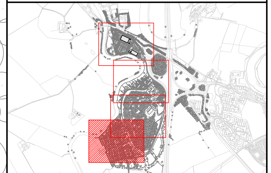
KEY PLAN (NTS)

LEGEND — EXISTING FOUL RISING MAIN → PROPOSED GRAVITY FOUL DRAINAGE → PROPOSED FOUL RISING MAIN